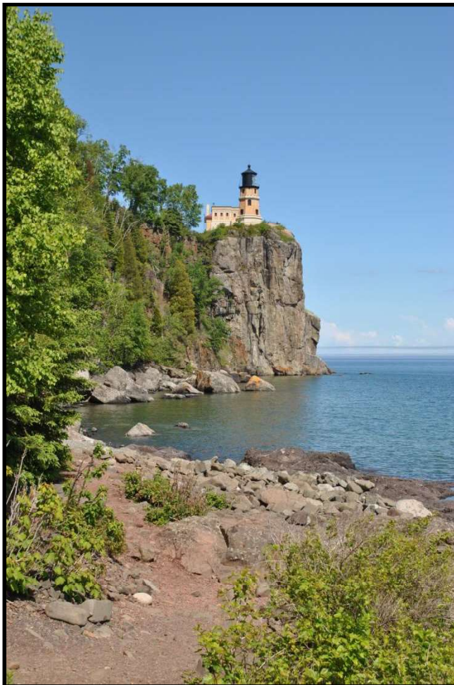
Split Rock Light House Two Harbors, MN

MSU Duluth Members live entirely on the economy. Most enjoy short commutes and live in Duluth, MN (5 minutes away), Superior, WI (15 minutes away) or Hermantown, MN (20 minutes away). Surrounding towns, like Cloquet, MN and Two Harbors, MN, are smaller with more rural settings yet still offer decent shopping and other amenities (30 to 40 minutes away). Should you have any questions about housing or are planning to have a commute that will exceed the normal 1-hour response timeframe, please contact your sponsor or division chief to discuss details. Remember that weather may delay your commuting time in winter months.