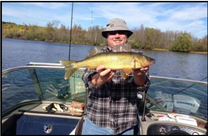
Excellent fishing for all species, especially Walleye, Northern Pike & Musky (St. Louis Bay (Duluth, MN))