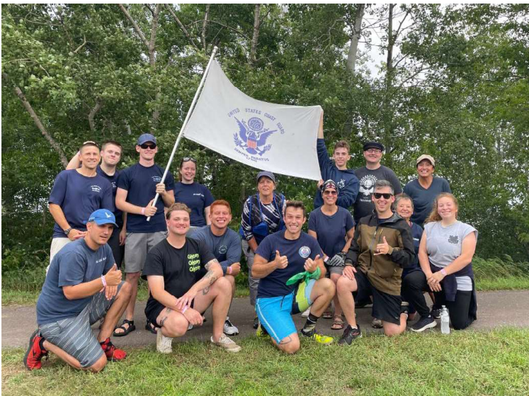
MSU & Station Participating in annual Dragon Boat race.