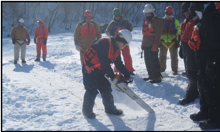
MSU Duluth participating in oil under the ice exercise