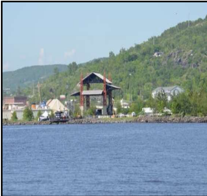
View of Duluth's Bayfront Festival Park