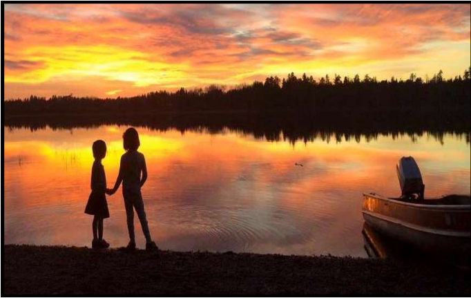
Nearby Family Camping (Indian Lake, MN)