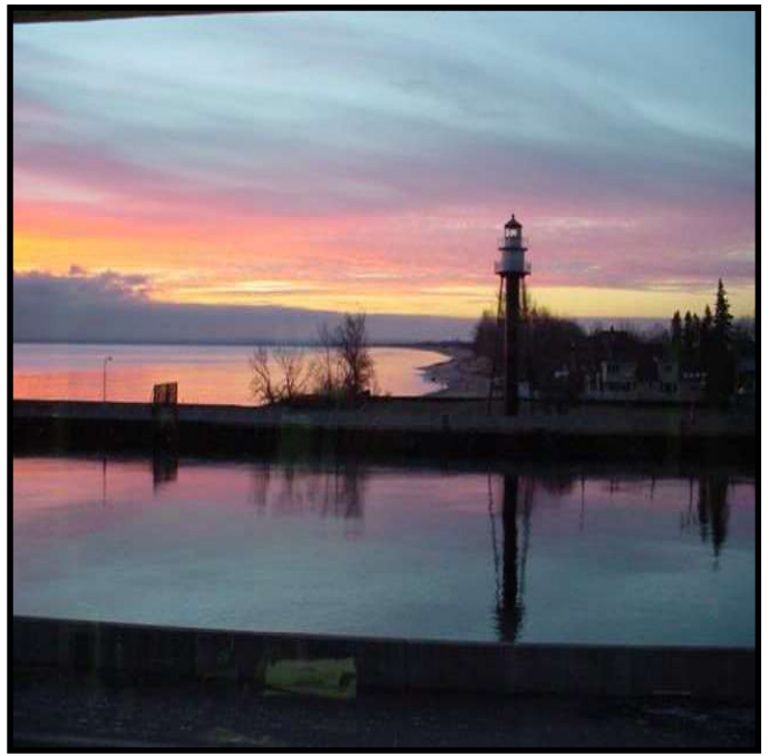
Duluth Harbor Entrance at sunrise