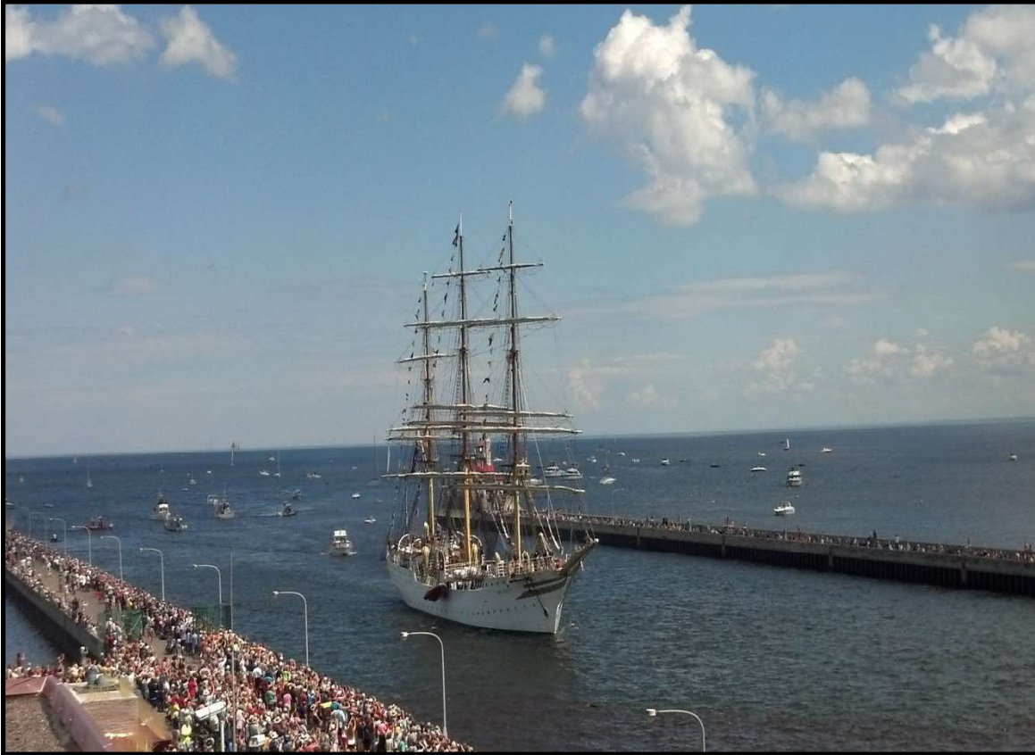
Spectators gather along the harbor entrance to welcome during Great Lakes Tall Ships Event

Duluth Outdoor Recreation: http://duluthoutdoors.com/