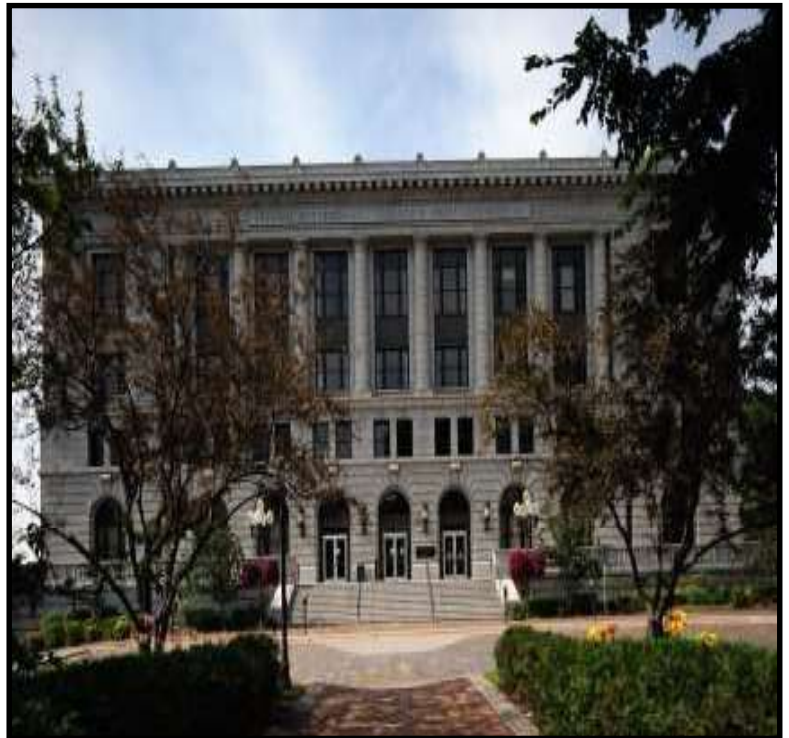
Gerald W. Heaney Federal Building

Duluth is considered a four-season outdoor mecca where members are encouraged to take advantage of the many activities, which are uniquely accessible from the heart of the city, ranging from the pristine shores of Lake Superior to 6,834 acres of city parkland and 178 miles of wooded trails. The North Shore runs to the Canadian border and offers countless smaller lakes and an expansive network of hiking, snowmobiling and ATV trails. Activities include canoeing (check out the legendary Boundary Waters Canoe Area (BWCA)), kayaking, sailing/boating, fishing/hunting, Alpine and Nordic skiing and even surfing. Duluth also attracts large crowds to see ships pass by the popular Canal Park area, port events (e.g., Tall Ships), Grandmas Marathon and outdoor music and festival events (e.g., Bentleyville's huge holiday lighting display, July 4th fireworks).