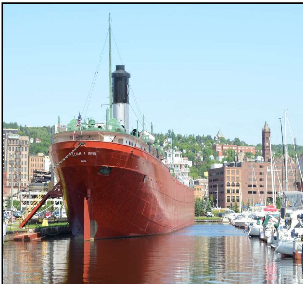
WILLIAM A. IRVIN - Museum Ship (Duluth, MN)

The Duluth Transit Authority is Duluth's public transportation system that offers steady bus service and a multitude of routes. More information can be found at: http://www.duluthtransit.com .