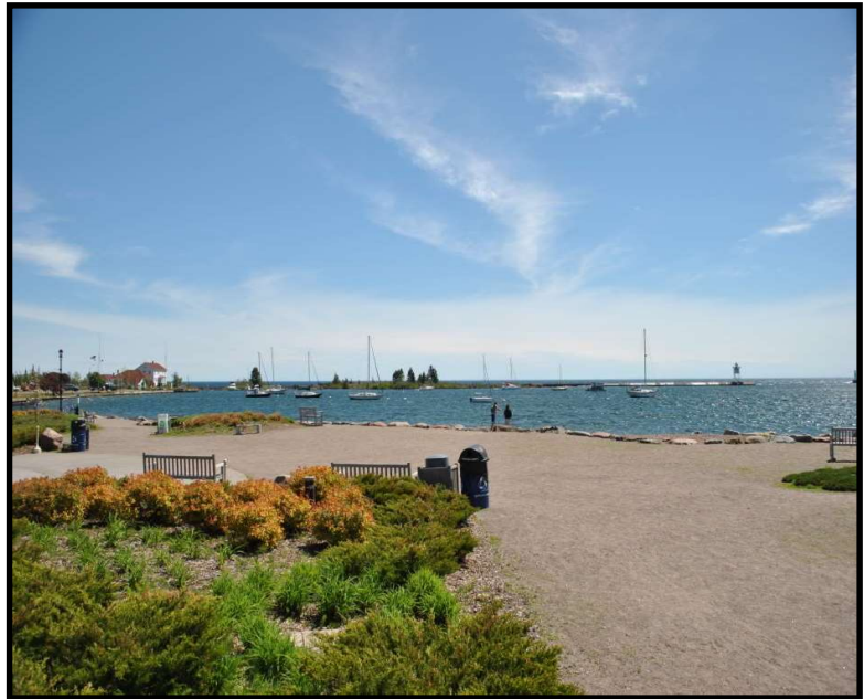
Grand Marais, Minnesota